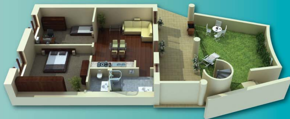
2 bed 2 bathroom with garden